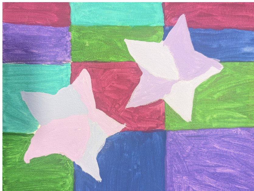
Art above was created by clients from JFSA.