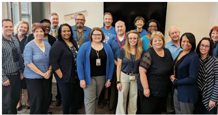
(above) Board staff wore blue for World Day of Bullying Prevention on October 1. (below) Members of the Cuyahoga County Suicide Prevention Coalition wore orange for Unity Day on October 23 to stand up against bullying.

Several board and staff members also attended The Centers and Circle Health Services annual benefit luncheon on October 16.