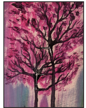
Client artwork from Far West Center's Art Helps and Heals Program art display May 2018.

Each month, two-dimensional artwork (paintings, sketches, drawings, etc.) created by clients within the ADAMHS Board system will be featured in the Ohio Room at the ADAMHS Board. Artwork from different artists will be displayed each month and exhibit months are assigned on a first-come, first-served basis.