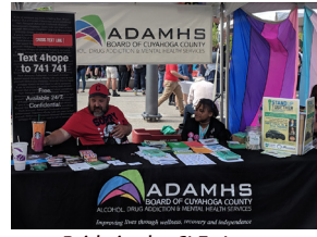
Pride in the CLE, June 2