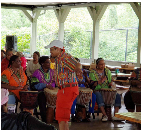
Life Exchange Center drummers provide entertainment for attendees!