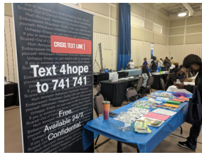
Nigerian Community Health Fair