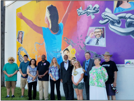
The "Treatment Works... People Recover: Breaking the Chains of Addiction" Mural was unveiled at 16021 Puritas Avenue on July 17.

The Alcohol, Drug Addiction and Mental Health Services (ADAMHS) Board of Cuyahoga County unveiled its “ Treatment Works... People Recover ” mural to visually promote prevention and education about the dangers of heroin and other drugs, reduce the stigma of seeking treatment, start public discussion, and celebrate recovery through public art.