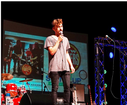
One of 60 comedians takes the stage to help raise funds for suicide prevention at the Stand Up Together Ohio Comedy Show