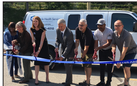
Ribbon cutting for Circle Health Services' new syringe exchange van!