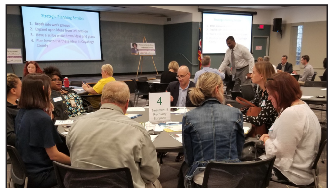
Attendees discussed how to put ideas into action.

Attendees spent the remainder of the meeting in work groups discussing the ideas that came out of last meeting's strategic planning session on aligning behavioral healthcare services in Cuyahoga County with RecoveryOhio's goals. There was discussion around how ideas brainstormed in the areas of Stigma and Education, Workforce Development, Prevention, and Treatment and Recovery Supports can be put into action. The outcomes of these discussions are being put into a plan for the group to review at the next meeting.