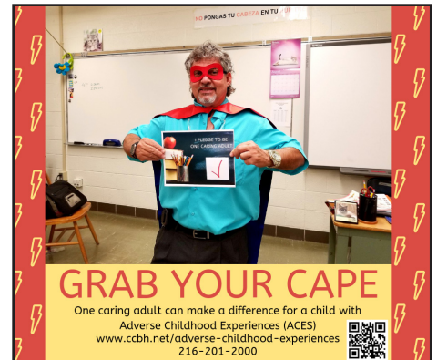
Teachers and staff at Berea-Midpark High School and Grindstone Elementary School agreed to be One Caring Adult and grab their capes! Thank you to all who participated in the campaign!

There are two main messages in the ACEs awareness campaign: Grab Your Cape – one caring adult can make a difference in a child's life , and statistics and information about ACEs. The campaign includes mall advertisements during back-to-school time, social media posts, banners to hang on schools, print resources, articles in local newspapers and newsletters. For more information, visit www.ccbh.net/adverse-childhood-experiences