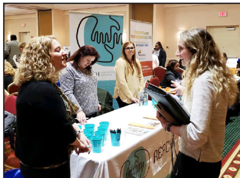
An employer and job seeker discussed potential job opportunities.

This free career fair attracted 40 employers and over 200 attendees. Some participants left with interviews already scheduled! Thank you to all who participated.