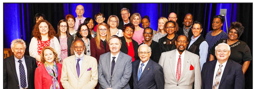
Board Members and staff in attendance gathered for a quick photo after the meeting.

The CY2018 annual report was released at the annual meeting, and can be found under the publications tab on our website: