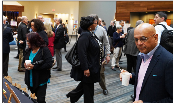
Guests enjoyed the over 70 pieces of art on display at the annual client art show and voted for their favorite art. There was everything on display from collages and masks to paintings and drawings, each with its own story.