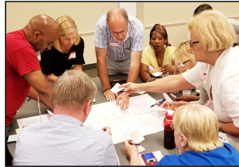
(left) Meeting attendees worked in groups to complete a strategic planning session exercise.