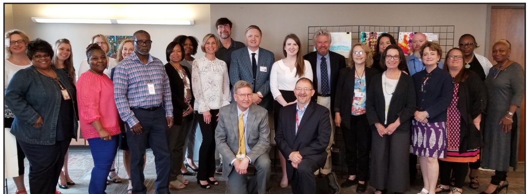
Providers, community members, Board Members and staff attended the Meet Your Legislators Series on June 17, 2019.