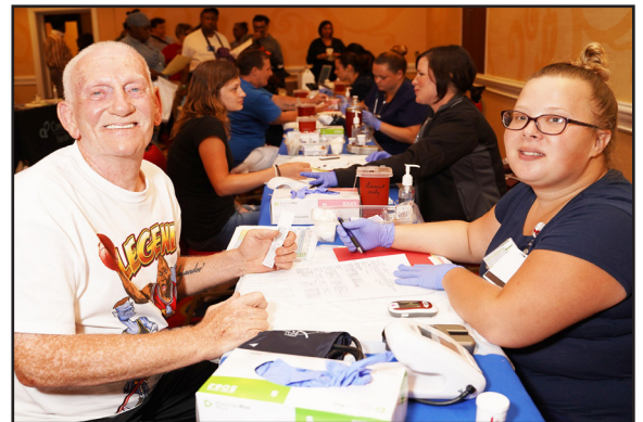
Over 100 clients were able to receive biometric screenings at the wellness fair!

Approximately 130 clients attended the fair. Each received a boxed lunch and participated in free health screenings including vision, foot, dental and biometrics. There was information at nearly 30 resources tables and a wide variety of interactive sessions like yoga, Reiki, meditation, de-stressing techniques, healthy cooking demonstrations, Tai Chi and art therapy!