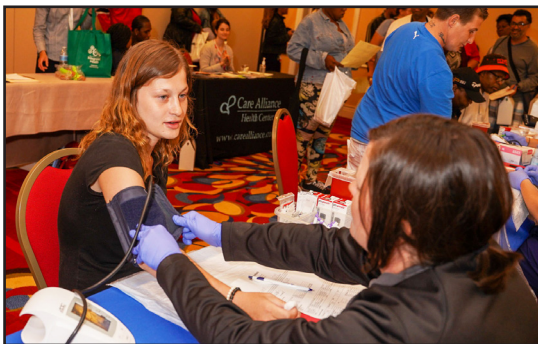
Blood pressure, vision, dental checks and more!

Participants were also able to complete a “Benefits Check-Up,” to ensure they are receiving the right benefits to meet their needs. Some attendees also shared stories of their personal journeys to wellness and all received a gift for participating in the wellness fair.