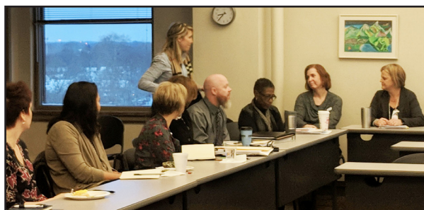
Participants of Progressive's Senior Leadership Development Program hear from staff about the system-wide issues we face.

Thank you to participants of the Senior Leadership Development Program for your hard work the last few months working through some of the issues facing our behavioral healthcare system.