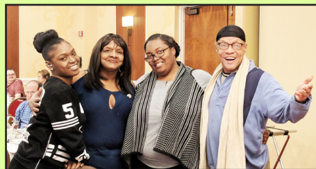
(bottom) Guests pose for a quick photo during the celebration.