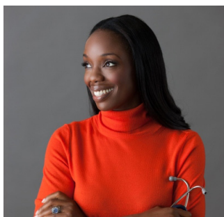
Nadine Burke Harris, M.D.

OSPF is also holding the first annual Suicide Prevention Summit on June 13-14 in Dublin. This is an opportunity for members from suicide prevention coalitions across the state to gather and learn from one another. Representatives from the Cuyahoga County Suicide Prevention Coalition will be in attendance.