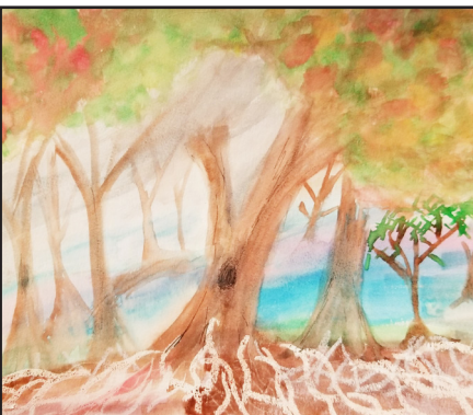
A watercolor painting featured in this month's art display from the Depression and Bipolar Support Alliance in Solon.

To find a drug drop off site near you, visit: takebackday.dea.gov .