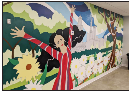
A beautiful new mural was revealed at the grand opening celebration.

The Women's Recovery Center held a Grand Opening, which was attended by board member, Katie Kern-Pilch, to celebrate their completed building remodel. In 2019, 115 women received treatment and 17 families were reunited as a result of the Center's work. They hope to serve triple that number now that the building renovations are complete!