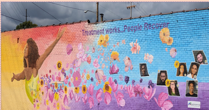
This beautiful and meaningful mural depicting hope for people living with heroin addiction - commissioned by the ADAMHS Board - is on display at 1981 East 55th Street. Our Facebook Live video post of the unveiling reached more than 7,300 people.