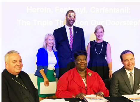
The Triple Threat Panel