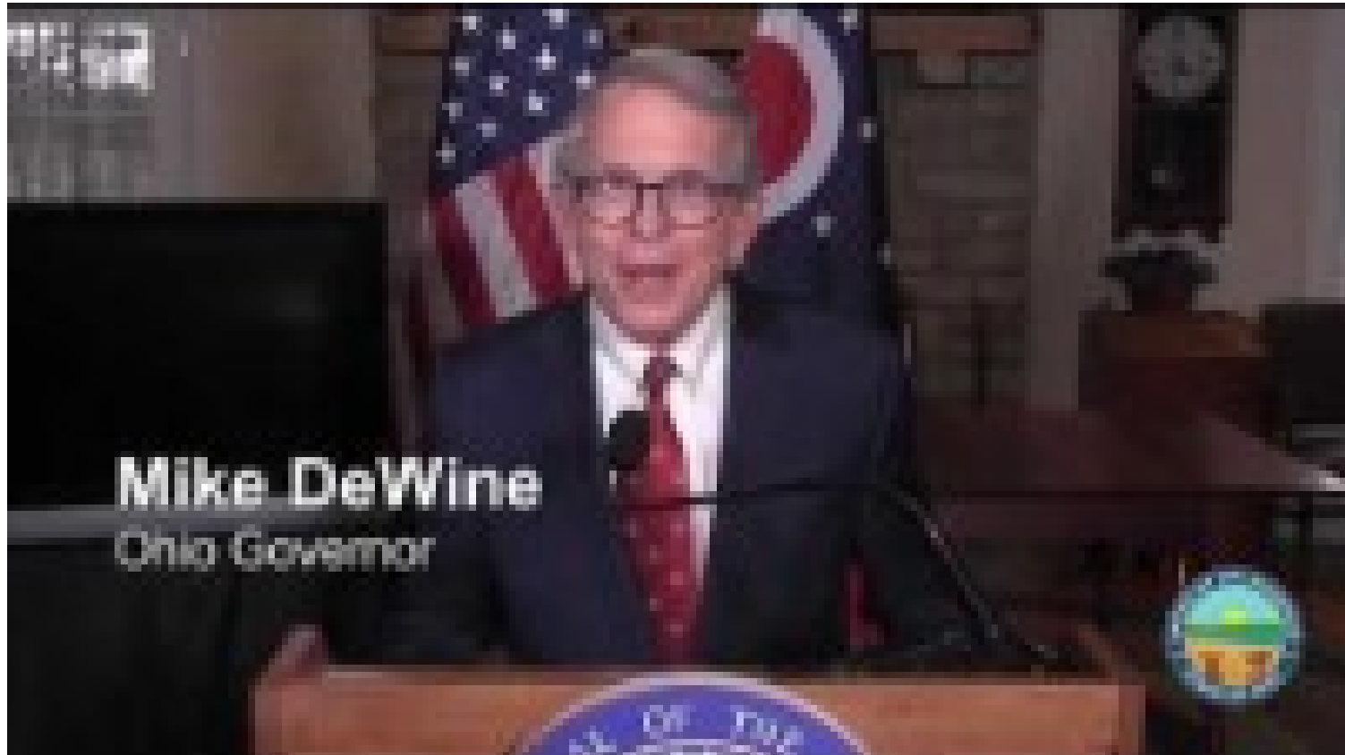
Mike DeWine Ohio Governor