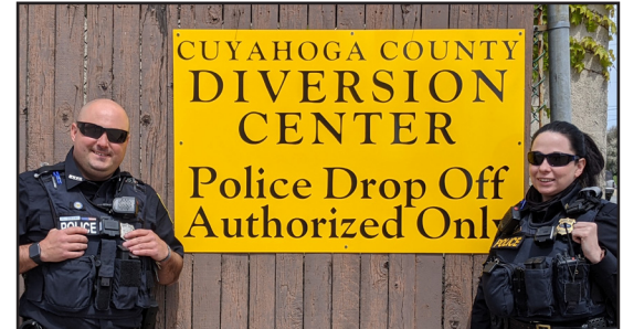
Officers at the April 23 open house.

An Open House was held for community behavioral health providers and Cuyahoga County law enforcement agencies at the Cuyahoga County Diversion Center on Friday, April 23. Oriana House staff provided tours of the new spaces and walked officers through the simple intake process. More than 200 law enforcement officers attended. A variety of community behavioral health partners also toured the site to learn more about the processes for and services available at the Diversion Center. Officers commented on the efficiency of the drop-off procedures and were encouraged to see this new option available to them to help individuals they come in contact with who would benefit from treatment rather than jail. The ADAMHS Board would like to thank the County, Oriana House, and FrontLine Service as well as local behavioral health providers and law enforcement for supporting this Open House.