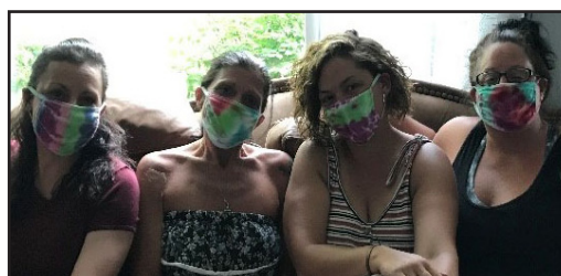
Residents from a local recovery home show off their creativity, mask tie-dye skills and fellowship in recovery!

How does that saying go? When life gives you boring, plain masks, make tie-dye masks instead! Here is a photo from residents (right) at a recovery house that glammed up the masks that were donated by the Ohio Department of Mental Health and Addiction Services (OhioMHAS) . What a great idea! Remember to grab a mask before you leave the house to help stop the spread of coronavirus.