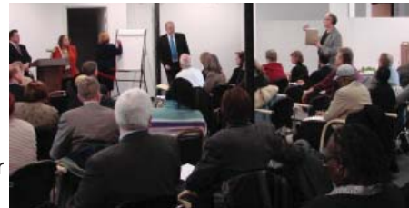
Over 60 provider representatives attended each of the work sessions.